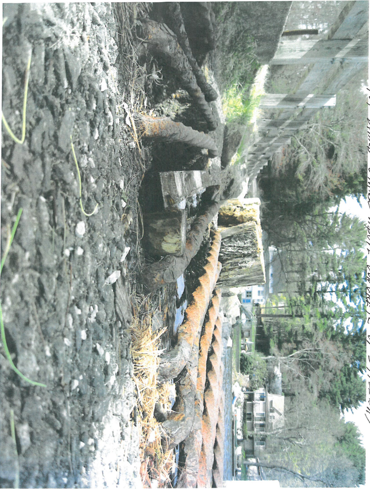
121 APPROX 2100000 11/20/14 1000000 1000000 1000000